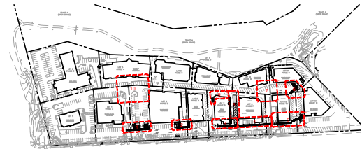
AERIAL KEY PLAN - SCALE: 1" = 200'